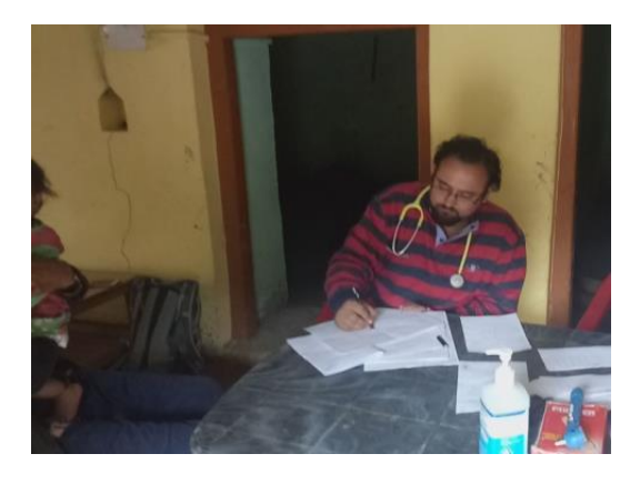
Here is the dr. that volunteered his time for very little in return.

The villagers are registering for the health camp. These villages are far apart and 227 people were able to come. These villages are in the Himalayan Mountains.