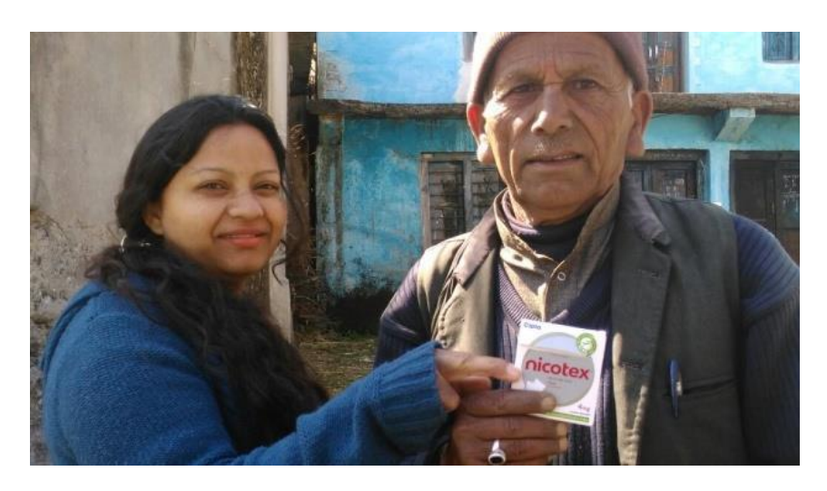
Page 4 of 9

They thanked the people who came forward to volunteer in the work for the new school and those who help them in the current school work also.