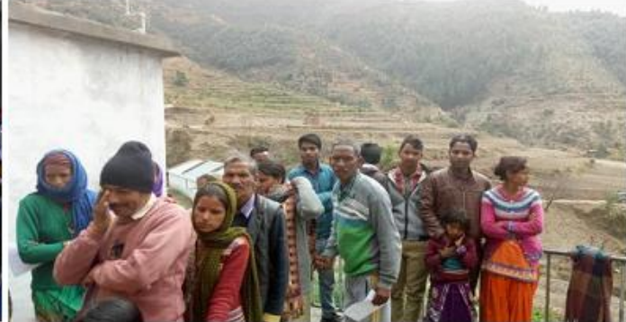
Waiting to see the dr.